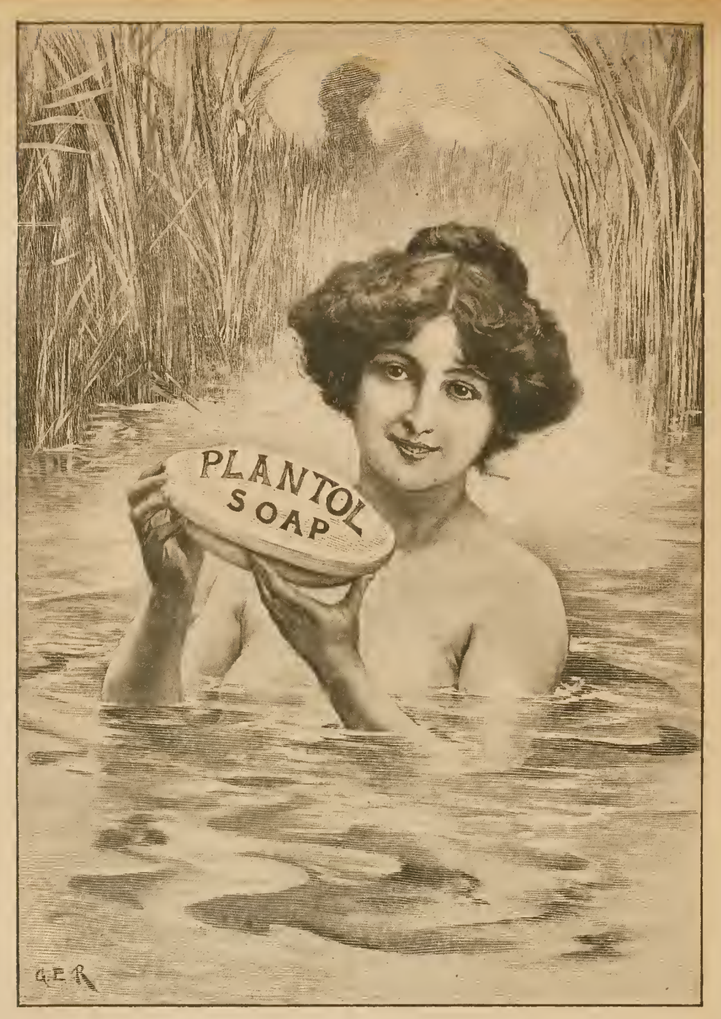
A Fragrant Toilet Luxury, Unequalled for Purity and Excellence. Made entirely of Sweet Yegetable Oils and Guaranteed free from Animal Fats.